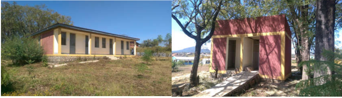
Tsore OSS Model and Toilet Buildings Respectively

The entire floor finish is cement screed; whereas, toilet floors are finished with ceramic floor tile. The quality of workmanship for the finished level of the ground is fair. Some irregularities and waviness is seen in almost every floor of the rooms. Chip wood ceiling is fixed in the internal rooms as well as at the verandah. The chip wood ceiling is painted but there is a sign of leakage in some of the rooms. The roof cover to be inspected for water leakage as this was visible on the ceiling during the inspection.