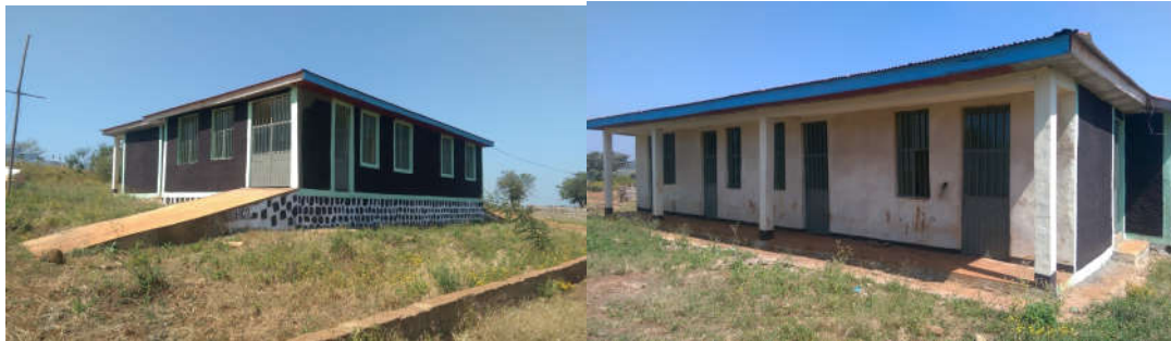
Gure Shembola- OSS Building