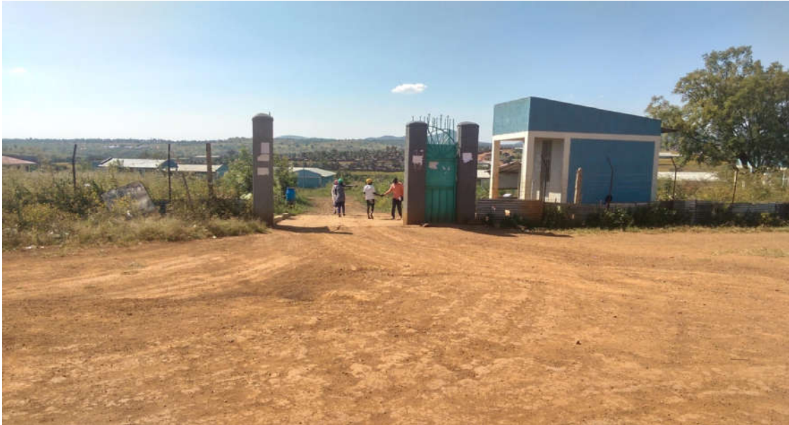
Fence: Tsore OSS Center